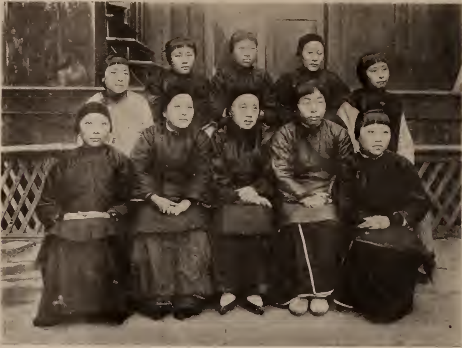
NURSES AND ASSISTANTS, MARGARET WILLIAMSON HOSPITAL