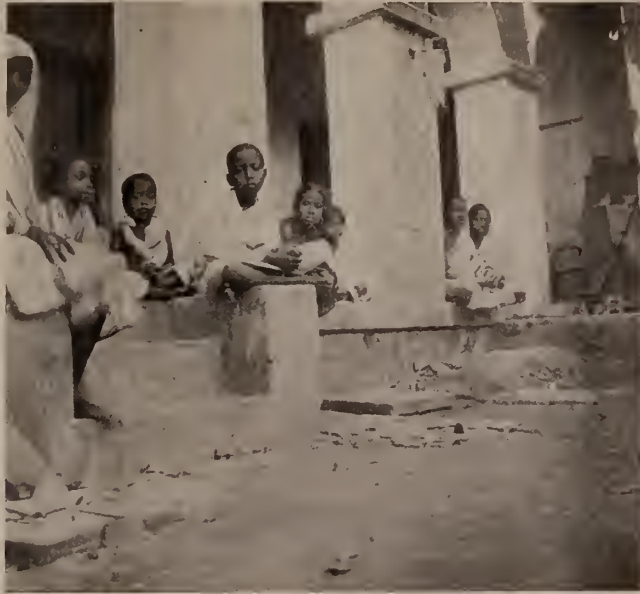
IN A ZENANA